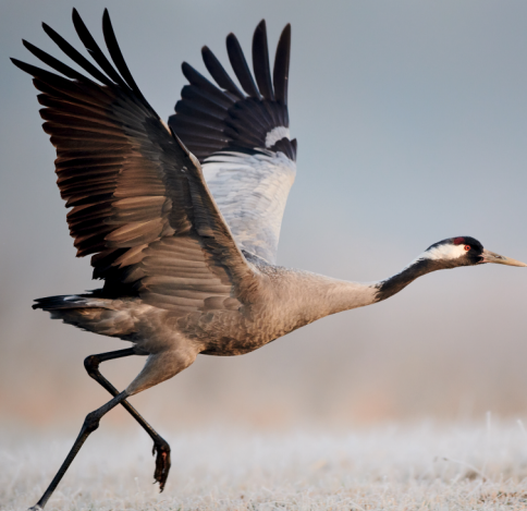
Common crane Grus grus