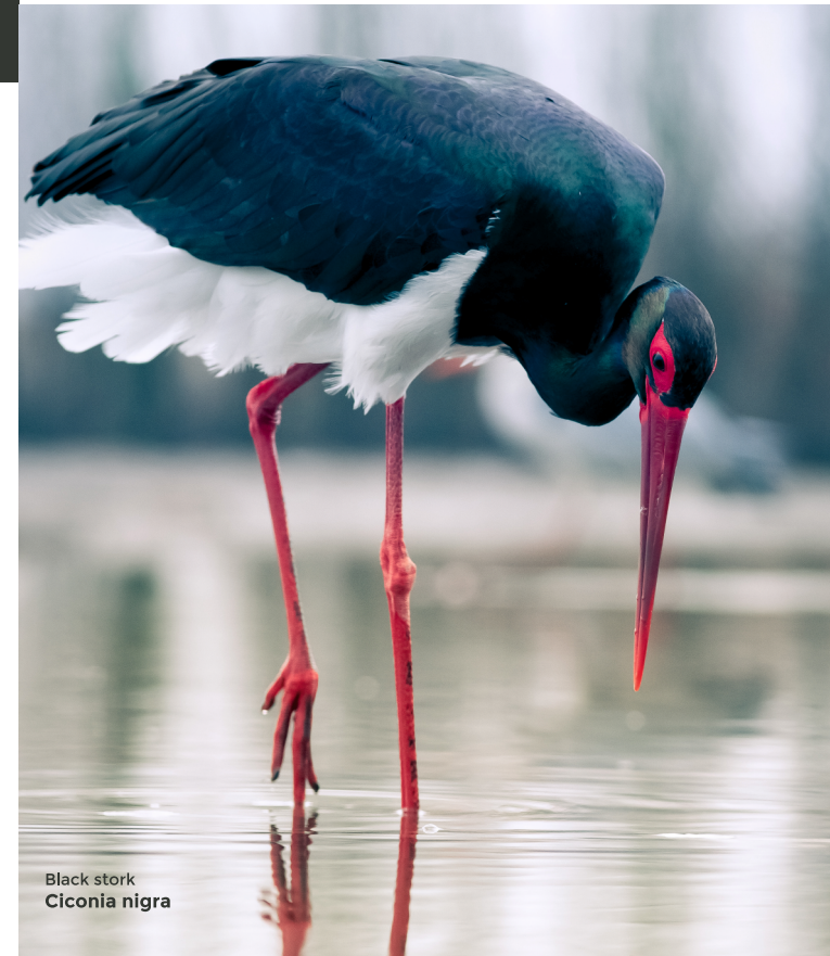
Black stork Ciconia nigra