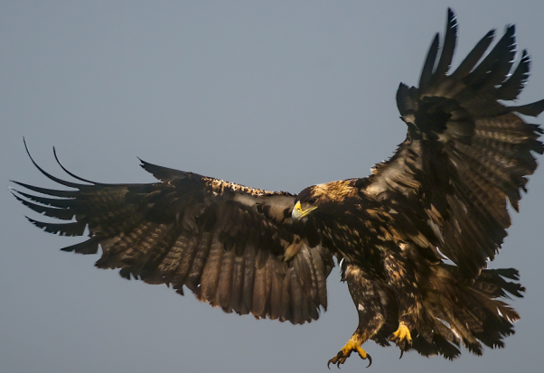
Spanish Imperial Eagle Aquila adalberti

This is the birthplace of EUROBIRD, the result of collaboration among organisations in Extremadura, the Alentejo and Central Portugal.