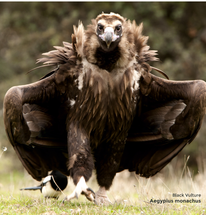
Black Vulture Aegypius monachus